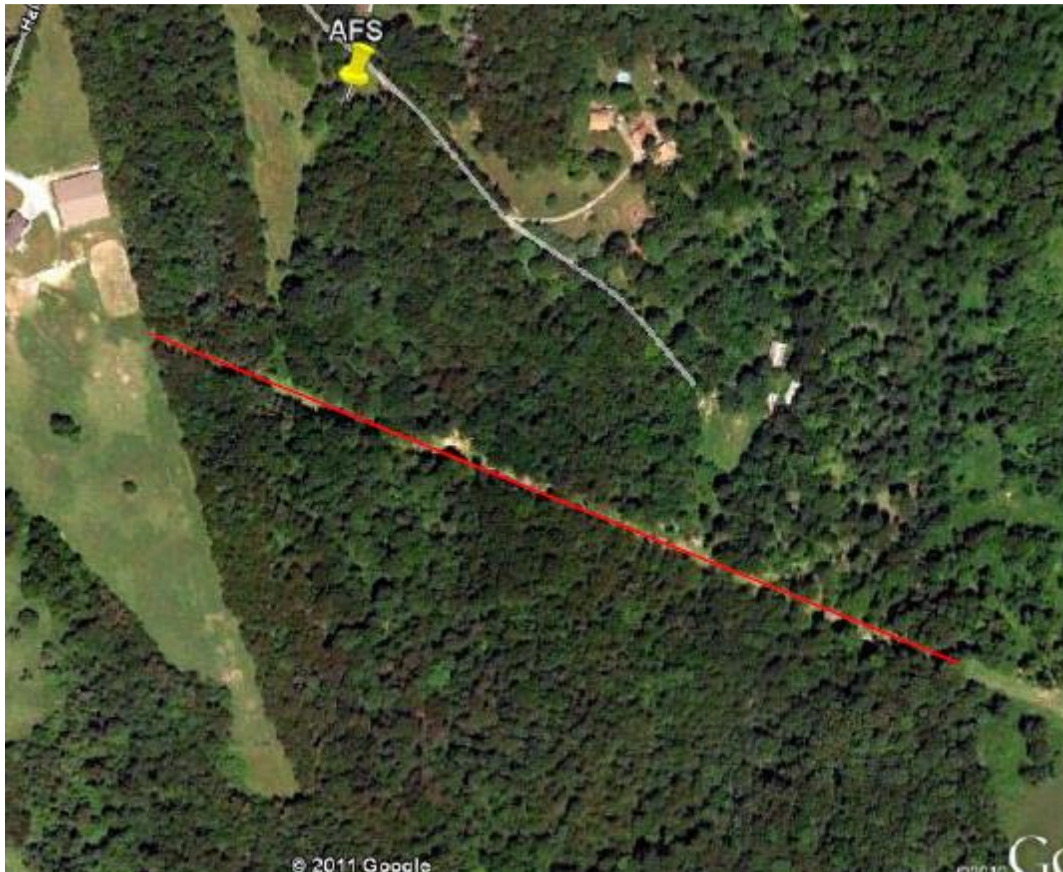
Figure 1. Air photo of the field station; the line represents the gas line right-of-way (ROW).

The 57-acre natural area depicted above, located five miles southeast of the College and owned by the Abernathy family, is available for research and course instruction. The terrestrial flora and fauna of the property are quite diverse (e.g., there are over 100 different tree species within its boundaries), and several small streams are present for sampling aquatic organisms. Students should not visit the field station unless accompanied by biology faculty.